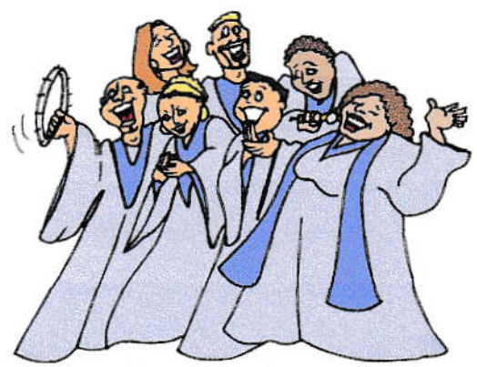
CHRISTMAS CANTATA Sunday, December 17<sup>th</sup> at 11AM. Our choir will be presenting the cantata, "O Little Town of Bethlehem" Please make plans to come.

DECORATE FOR HANGING OF THE GREENS We will decorate for the Hanging of the Greens on Saturday, December 2<sup>nd</sup> starting at 830AM. Please come help us!